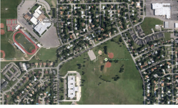
High Consequence Area (PHMSA Fact Sheet: High Consequence Area (HCA))