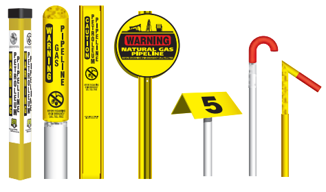
TriView™ Marker, Dome Marker, Flat Marker, Round Marker, Aerial Marker, Casing Vent Markers.